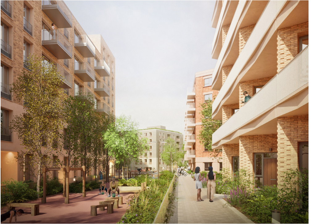
Illustrative View of Pocket Parks - Proposed West Kentish Town Estate Masterplan

of my commitments was to ensure that the West Kentish Town redevelopment progresses. This commitment was solidified further when I was appointed as the Cabinet Member for New Homes and Community Investment in 2024, the portfolio which oversees redevelopment in our borough. I am proud that in my time as cabinet member, I have overseen further progress of this scheme as it takes its next steps forward in its journey through the planning application process. The redevelopment reflects the true needs and desires of the community. This project exemplifies Camden's