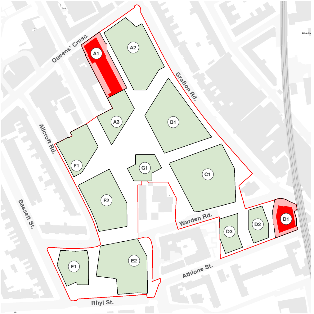
West Kentish Town Estate Detailed and Outline Plots