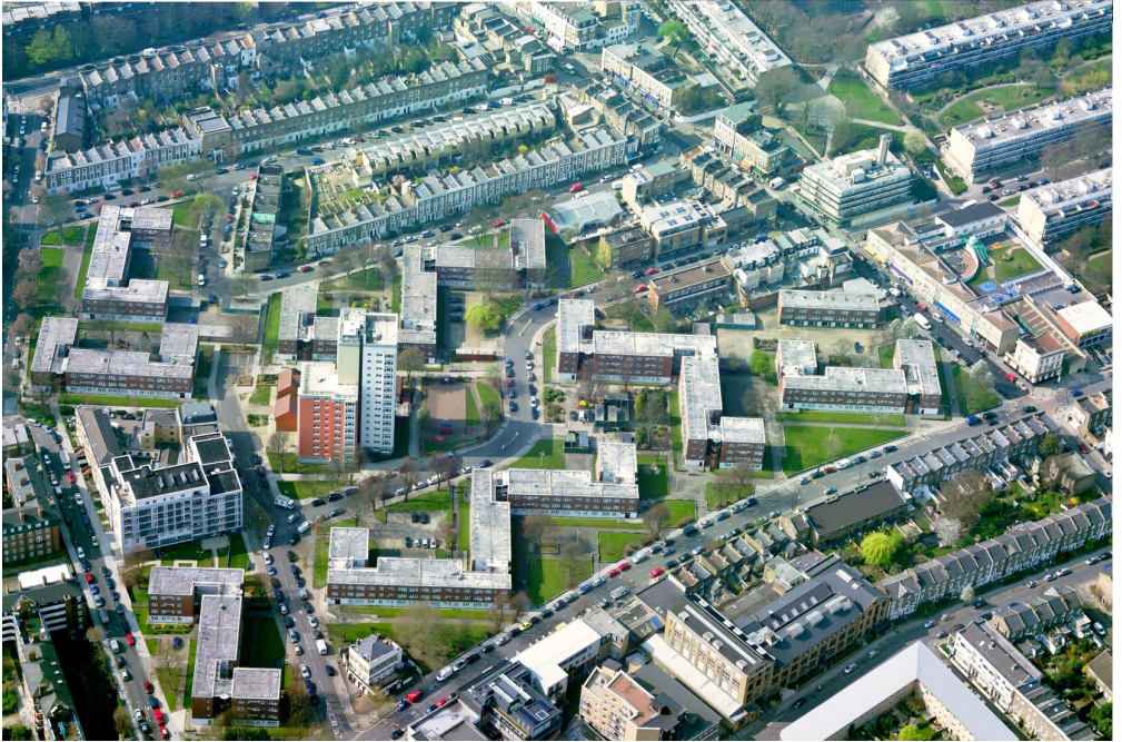
Existing Aerial View of West Kentish Town Estate