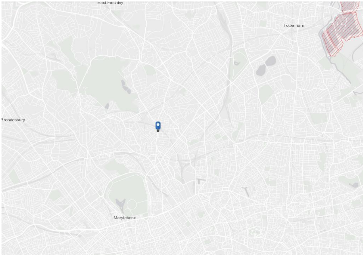
Map 1 – Framework area plotted on Natura Network Viewer

5.4 As this SPD is in conformity with the policies of the Local Plan, and does not introduce new policies, the guidance contained in the lower level SPD is similarly unlikely to have significant effects on sites of European importance for habitats or species, or an adverse impact on the integrity of those sites.